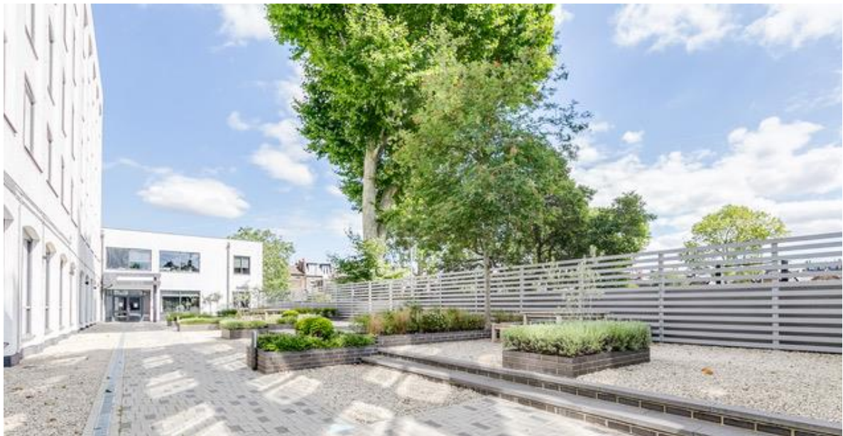
Landscaped gardens to enjoy and relax

The scheme has proved immensely popular with many tenants including, Gram Games, Vista entertainment, Odds checker, H&H Global, Deltek, Sybarite Architects, Kau Media and THIS.