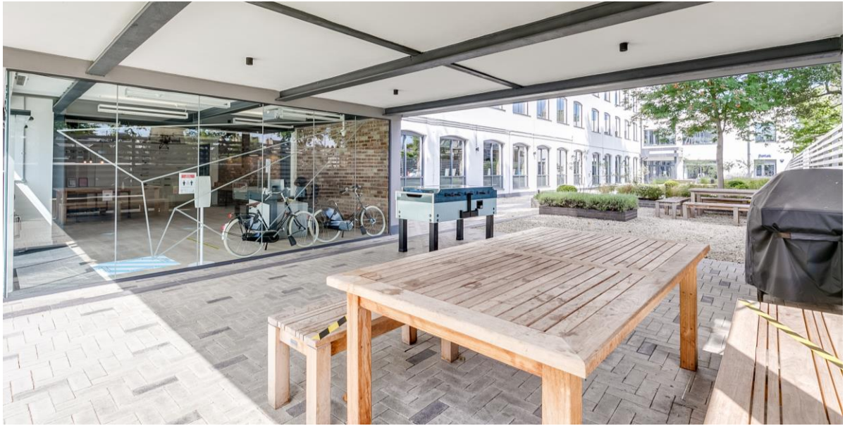
Fantastic outside space with Table football and BBQ

Originally the site of the Alliance Airplane Company Ltd, The Aircraft Factory is a converted factory structure with full ceiling heights that provides a campus office environment with on-site coffee bar (Cable & Co) and break out areas.