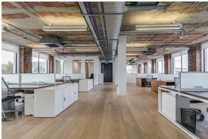
Library photo showing furnished finishes.

Currently being fitted by the landlord to provide fully fitted offices with furniture, meeting rooms and breakout areas so you can move straight in and start running your business from day one.