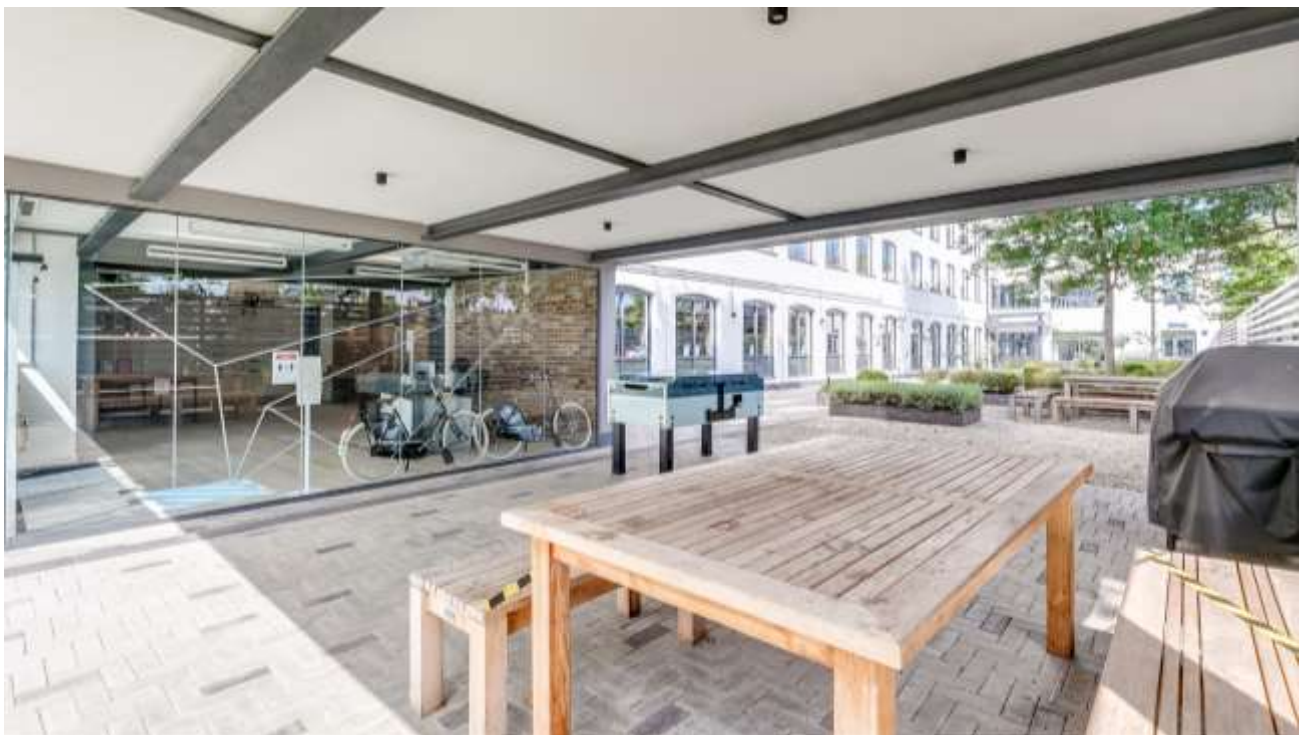
All occupiers have access to the external communal areas

New leases direct from the landlord available on terms to be agreed.