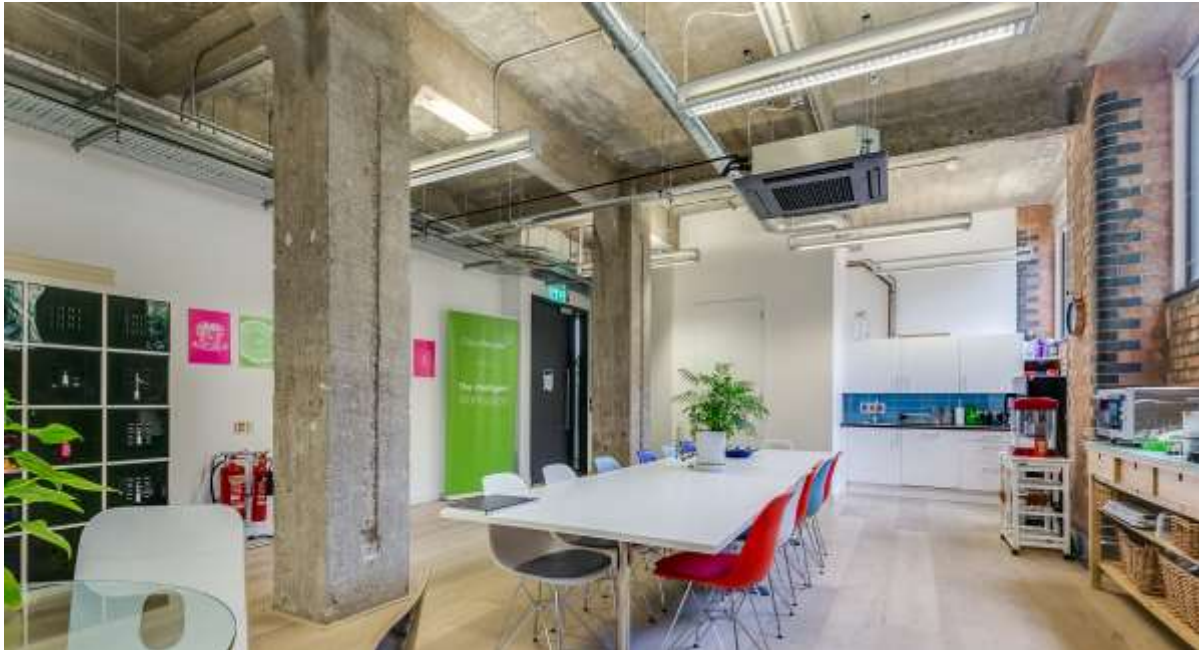
Great working environment with high ceilings