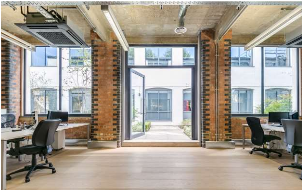
Direct access to communal gardens from ground floor suite

5,137 SQ FT 4 TH WITH GREAT VIEWS AVAIL OCT 21