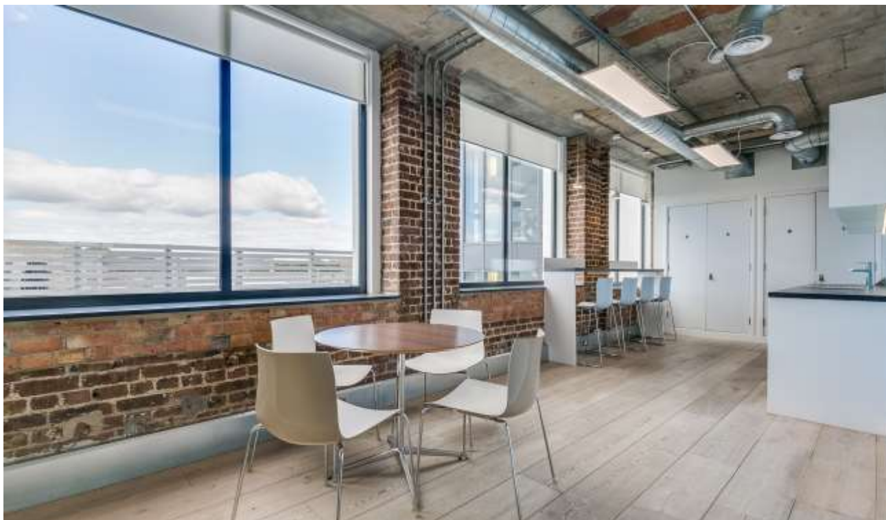
Private breakout/ kitchen areas